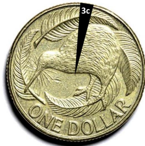
Figure 1 Successful claimants’ compensation Compared to what they ask for

These tribunals’ findings are binding and there is usually only limited opportunity to appeal.